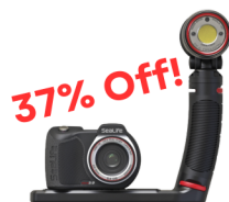
SeaLife Micro3.0 Explorer Gift Set