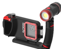
SeaLife SportDiver Pro 2500 Set