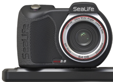
Micro3.0 camera, Sea Dragon 2000F light, and tray

Free SeaLife underwater Micro3.0 Camera, Sea Dragon 2000F light, and tray with qualifying gear purchase!