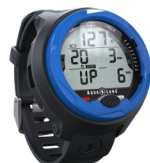
AQUALUNG i100 Wrist Dive Computer