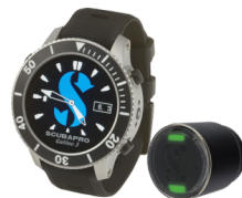
SCUBAPRO Galileo 3 w/ Transmitter

Come see the latest innovations from SCUBAPRO and learn some interesting facts about all diving equipment!