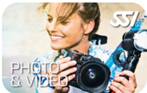
Photo & Video Learn to dive safely with an underwater camera and gain in-depth knowledge to use, maintain, and store your imaging gear. $100

And many more certifications! Dolphin SCUBA Center is proud to have been a part of hundred of thousands of divers' SCUBA journeys for over 45 years with a vast array of specialty certifications and skills mastered. Our Instructors are always learning, too, and gaining new skills and teaching credentials constantly to bring our students varying specialty certifications to tailor each students' SCUBA diving to their particular interests and passions. Have an SSI specialty skill you would love to learn but aren't seeing? Connect with our SCUBA Training Coordinator!